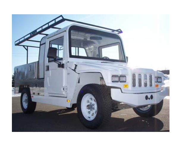
2008 Model Owner Manual